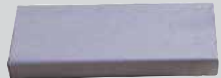
Standard Kerb Weep Hole