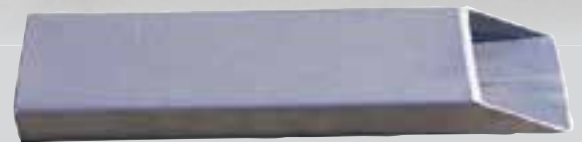
Roll Kerb Weep Hole